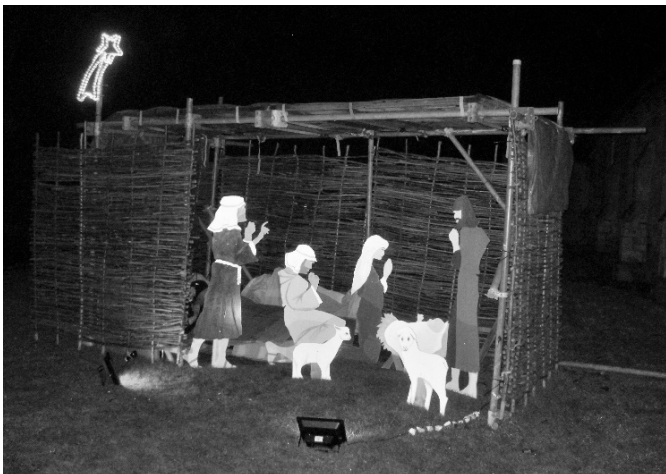
Full illuminations on