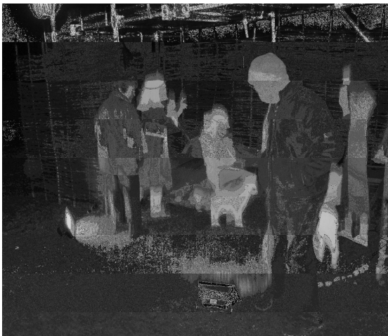
Visitors at 8pm on New Year's Eve