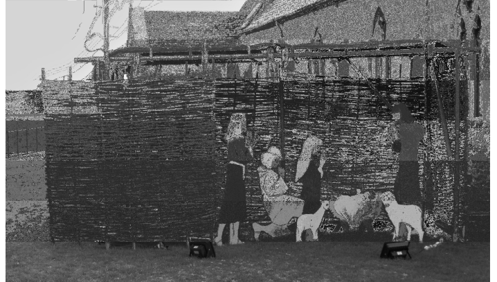
A view of the whole stable