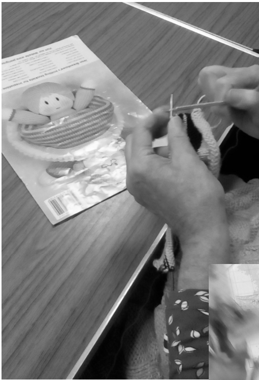
More work in progress at the Art & Craft club