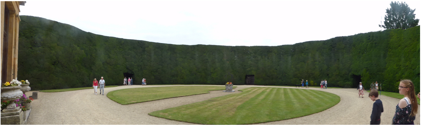
The famous yew hedge at Cirencester Park