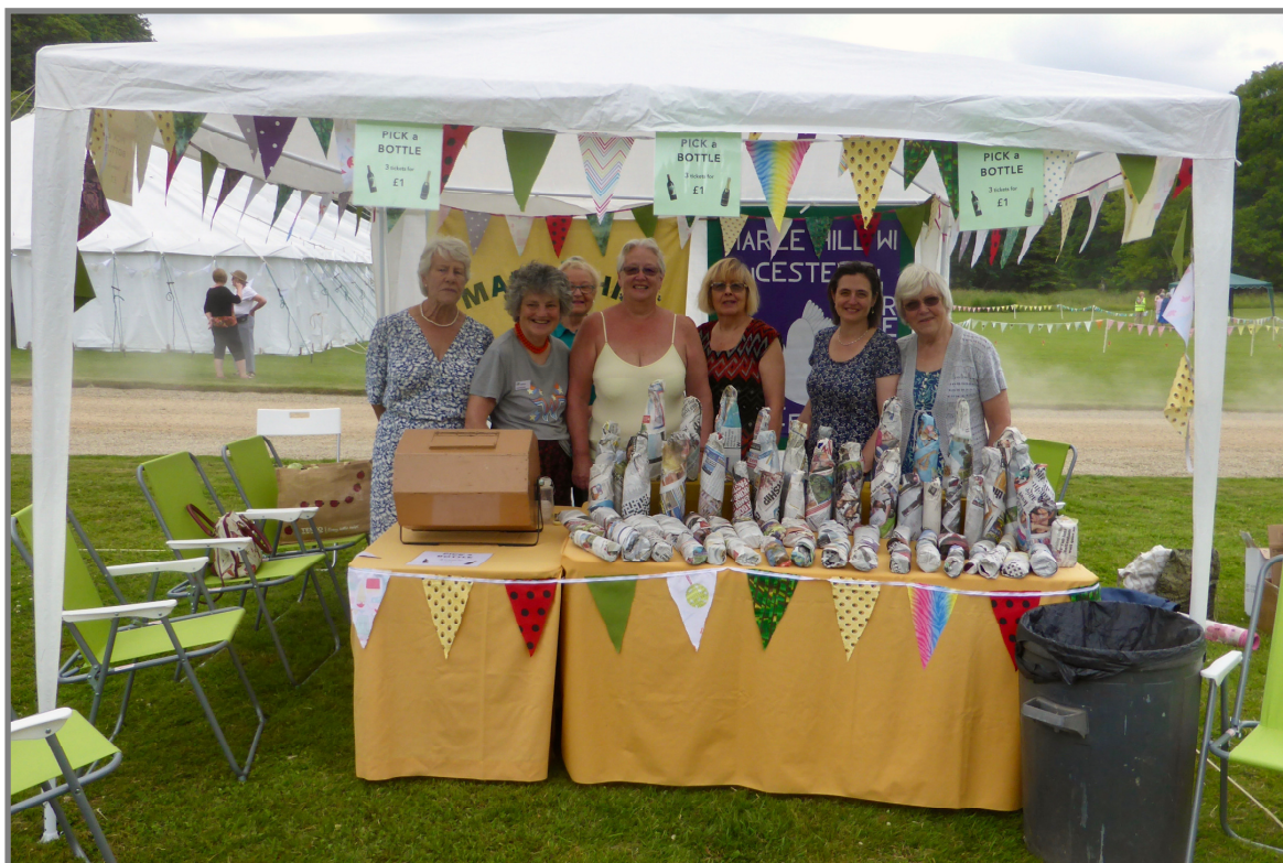
Marle Hill WI members at their "Pick a Bottle" stand

The Centenary Village Show took place in the gardens of Cirencester Park on a glorious sunny day. A marquee of exhibits and the displays in the arena included dancing, police horses and falconry. The many stalls run by various county WIs proved a great attraction and we did well on our ‘Pick a Bottle’ stand. We were invited to explore the beautiful gardens including the enormous record-breaking yew hedge, an amazing sight!