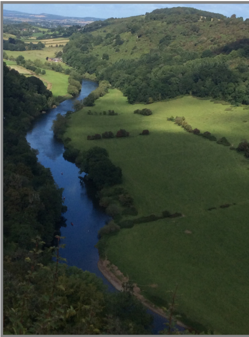
The River Wye from Symonds Yat

Day 4 was a Tour of the Forest of Dean. Our first port of call was Gloucester Docks, then a long lazy drive round Cinderford, lunching at the picturesque Beechenhurst, near Speech House, then up to the stunning views of Symonds Yat, looking down to the River Wye, then dropping down the valley to the Tintern Abbey ruins on the banks of the Wye, meandering through Monmouth, Redmarley, Haw Bridge and then home.