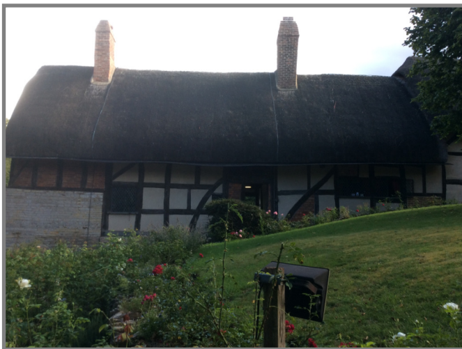
Anne Hathaway's Cottage, Stratford-on-Avon