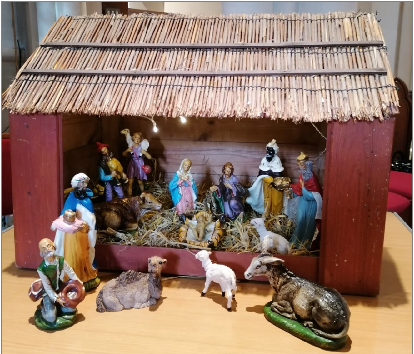
The crib in St. Lawrence's Church

If you would like to enquire about baptism (also called christening) or would like to book a wedding in St Lawrence's church, please contact the Team Office, which is open Monday to Friday from 9am until 12 noon. The office is based at St Nicolas' Church in Swindon Lane. Contact the Office on 244373 or admin@northchelt.org.uk